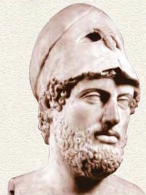
Pericles 495–429 B.C.

Pericles came from a rich and high-ranking noble family. His aristocratic father had led the Athenian assembly and fought at the Battle of Salamis in the Persian Wars. His mother was the niece of Cleisthenes, the Athenian noble who had introduced important democratic reforms.