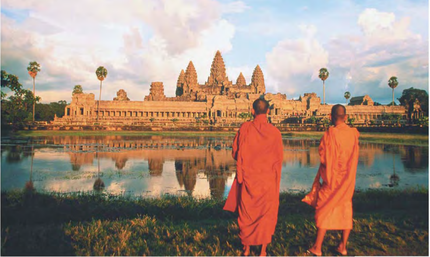
▲ Buddhist monks view a temple at Angkor Wat in Cambodia.

The Religious Community The five disciples who heard the Buddha’s first sermon were the first monks admitted to the sangha , or Buddhist religious order. At first, the sangha was a community of Buddhist monks and nuns. However, sangha eventually referred to the entire religious community. It included Buddhist laity (those who hadn’t devoted their entire life to religion). The religious community, together with the Buddha and the dharma (Buddhist doctrine or teachings), make up the “Three Jewels” of Buddhism.