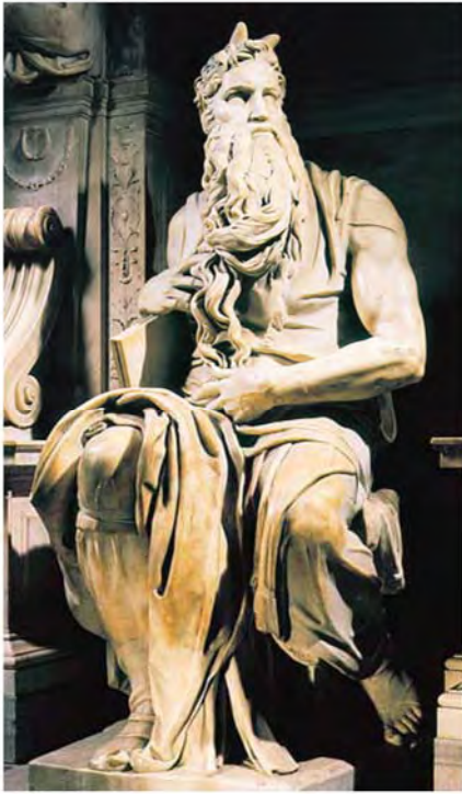
▲ This statue of Moses was carved by Michelangelo.

The God of Abraham The Bible tells how Abraham and his family roamed for many years from Mesopotamia to Canaan to Egypt and back to Canaan. All the while, their God, whose name was Yahweh, watched over them. Gods worshiped by other people were often local, and were associated with a specific place.