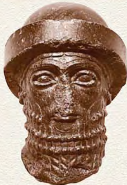
Hammurabi ? -1750 B.C.

The noted lawgiver Hammurabi was also an able military leader, diplomat, and administrator of a vast empire. Hammurabi himself described some of his accomplishments: