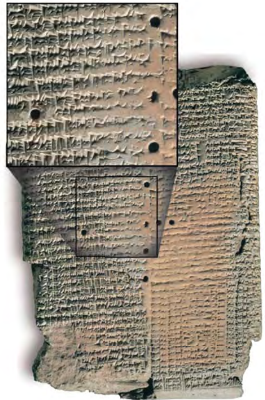
▲ The wedge-shaped symbols of cuneiform are visible on this clay tablet.

Sumerian artisans relied on new technology to make their tasks easier. Around 3500 B.C., they first used the potter’s wheel to shape jugs, plates, and bowls. Sumerian metalworkers discovered that melting together certain amounts of copper and tin made bronze. After 2500 B.C., metalworkers in Sumer’s cities turned out bronze spearheads by the thousands. The period called the Bronze Age refers to the time when people began using bronze, rather than copper and stone, to fashion tools and weapons. The Bronze Age started in Sumer around 3000 B.C., but the date varied in other parts of Asia and in Europe.